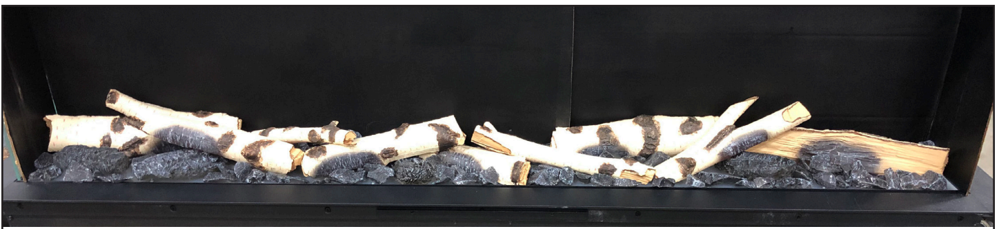
Figure 7. Log Placement Reference per Appliance