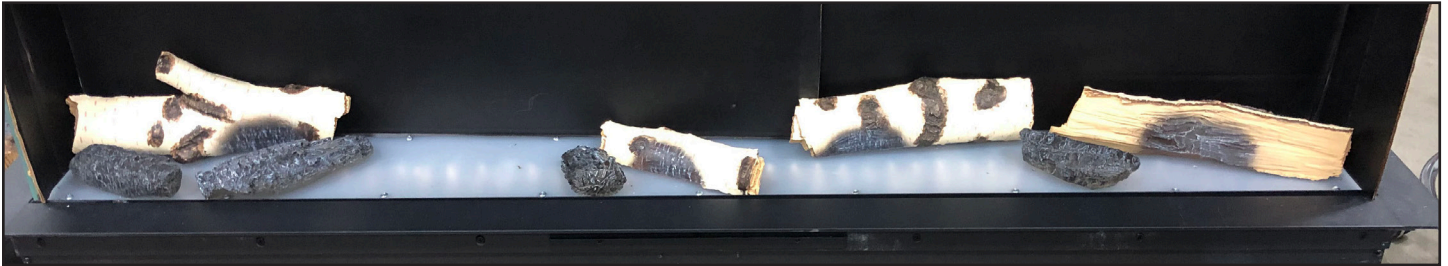
Figure 5. Place Small Logs