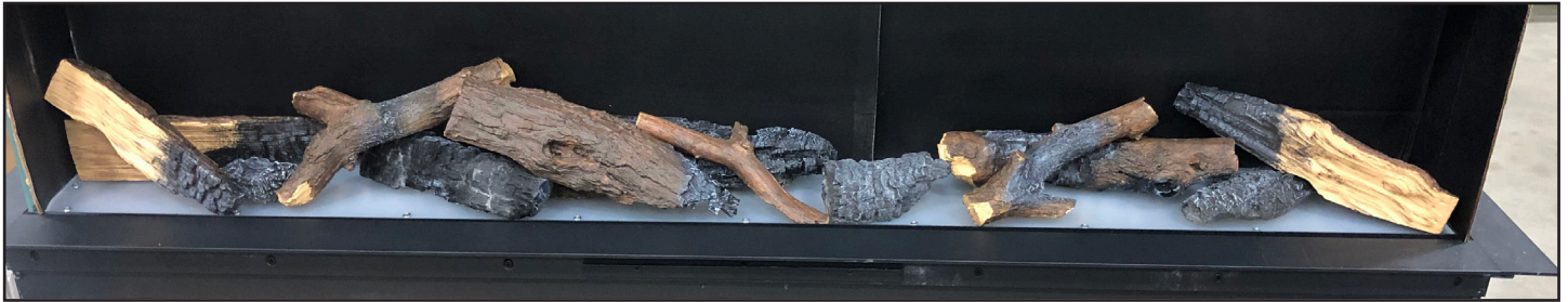
Figure 3. Place Remaining Logs