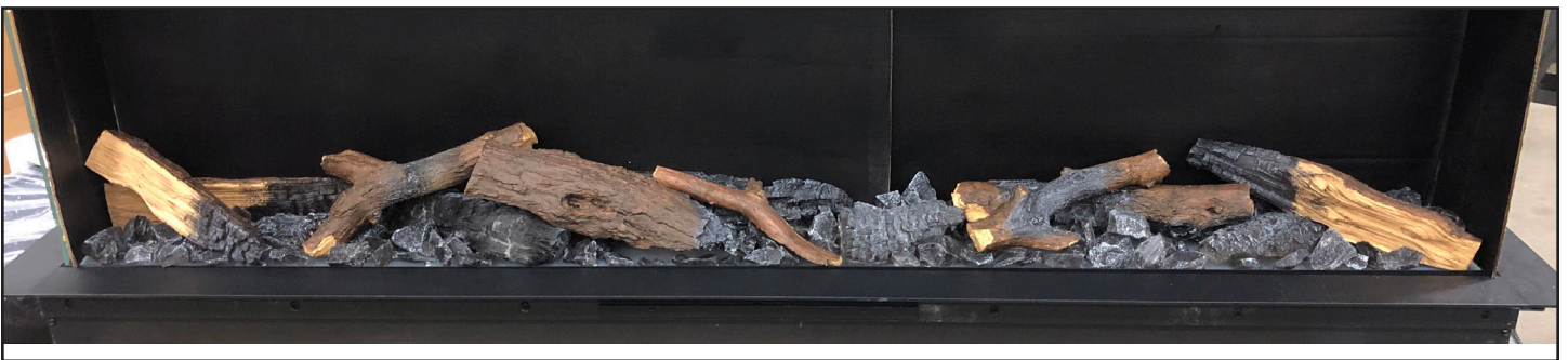
Figure 4. Log Placement Reference per Appliance