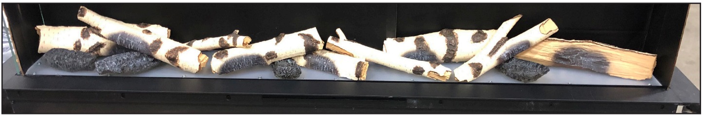
Figure 6. Place Remaining Logs