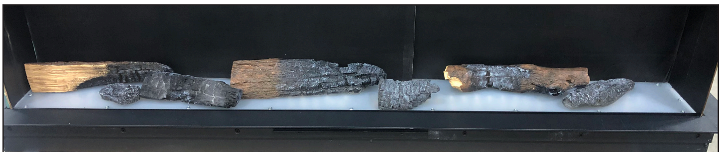
Figure 3. Place Small Logs